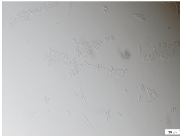
Fig. 1. C. guilliermondii corn meal agar with Tween-80, original magnification 400x

Concerning the clinical evolution of the wounds, we found that for patient A, the MIC for both drugs decreased as the wound dimensions also reduced (Fig. 2). For patient B, the MIC remained unchanged, and the wound showed no significant clinical changes. For patient C, we